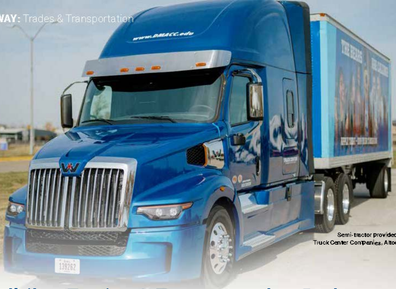
Semi-tractor provided by Truck Center Companies, Altoona