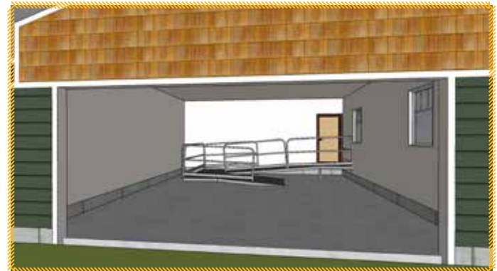
The garage is handicapped-accessible, as is the rest of the facility.