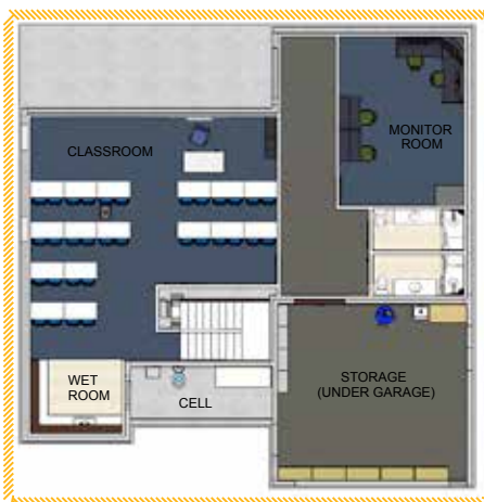
▲ Proposed lower level

The campaign goal is $300,000 and the entire project will be funded through private donations. If all funds are