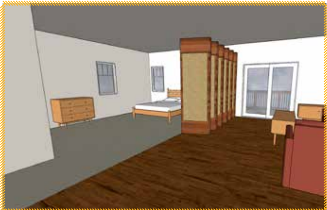
Accordion walls allow for maximum flexibility in altering the space to cater to specific training objectives.