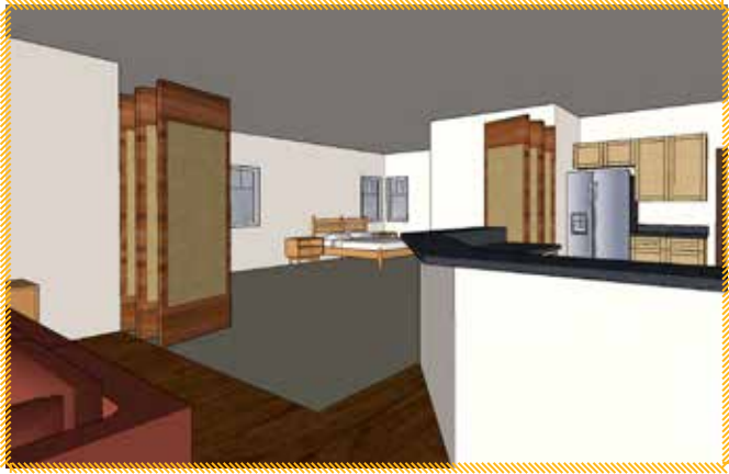
The view from the entryway shows an open floor plan, including a living area, kitchen and bedrooms. There are folding doors included on the main level to allow for a number of different configurations, based on the training taking place.