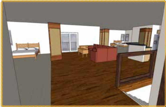
The view looking back toward the living area shows a master bedroom area and stairs down to the basement.